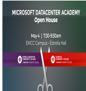
Microsoft Datacenter Academy opens at Estrella Mountain