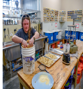
Free Food Is Ready for Harvest